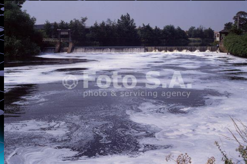
Detergent foam cover river surface