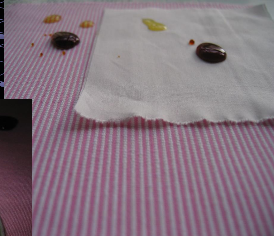
Soy Sauce Stain